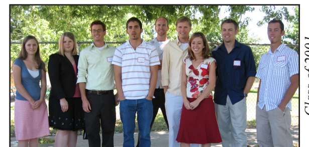
Class of 2001