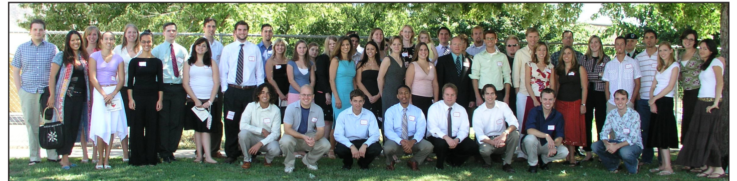
The Mesa Grande Academy Alumni at Alumni Sabbath, September 9, 2006

Hello, to all MGA Alumni! On September 9, 2006, over 70 Mesa Grande alumni returned to campus to reminisce and reconnect with former classmates and teachers. The 10 year Honor Class (1996) was well attended with alumni coming from Ohio, Michigan from Tennessee. It is always good to see everyone and catch up on your lives. Ten years goes by quickly and even though we for the most part can recognize you, there has been some change.