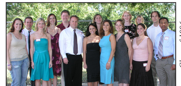
Class of 1996