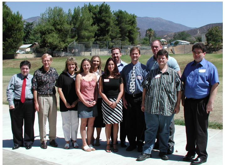
Class of '92, 10-year honored class

Plan now to attend Alumni Sabbath on September 13, 2003.