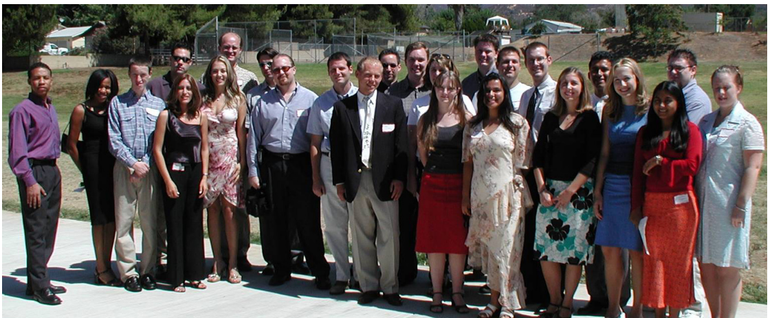
MGA alumni returned last September 14 for a Sabbath of remembering the old and seeing what's new with each other and their school.