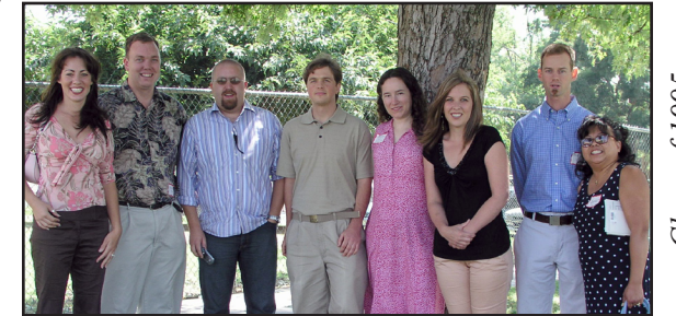
Class of 1995

Freshman and Sophomore classes being split.