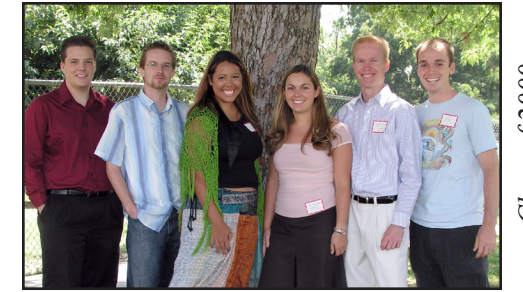
Class of 2000

The Annual Campaign last year brought in over $20,000 which along with money raised from sponsors brought the total amount to $80,000 which enabled 55 students to attend MGA. The academy enrollment last year was 142 with the