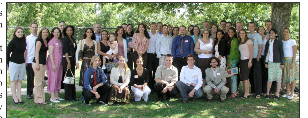
The Mesa Grande Academy Alumni at Alumni Sabbath, September 10, 2005