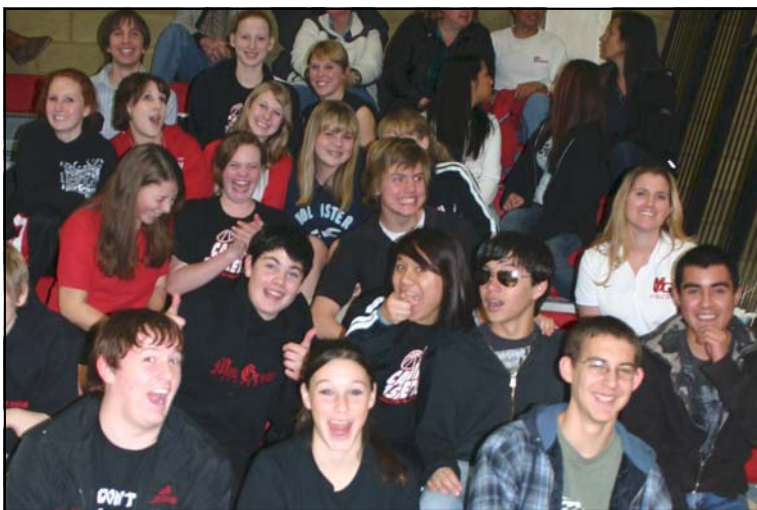
“Let’s Go Cardinals, Let’s Go!!!!” The enthusiastic crowd cheers for the Cardinals.